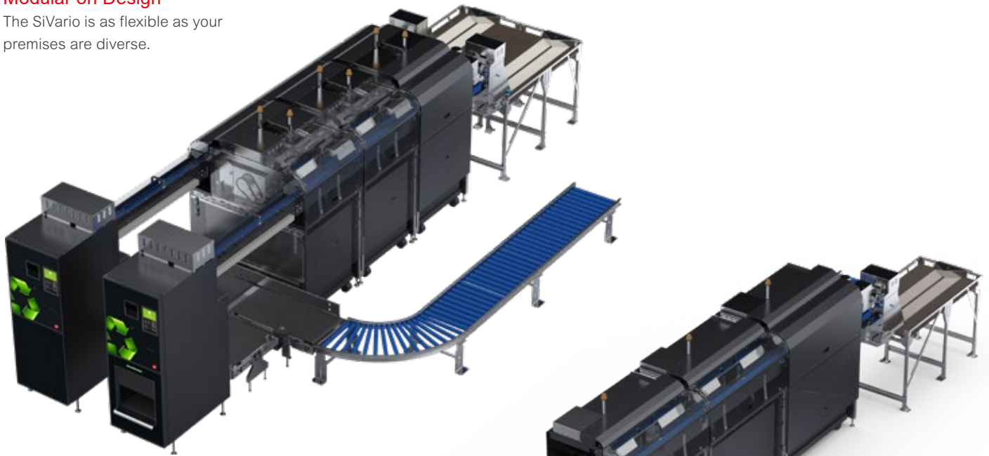
Example: With crates and without crates and bottle tables

The SiVario is as flexible as your premises are diverse.