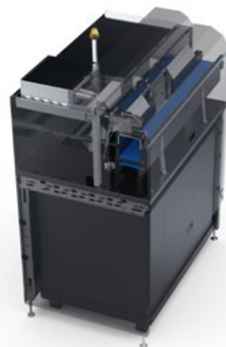
MonoSort inside view