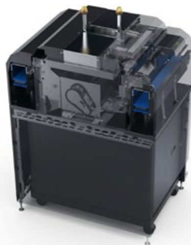
DualSort inside view