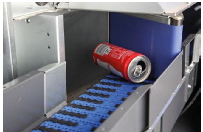
The switch redirects the empty container