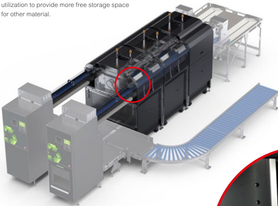
Example: DualSort with and without crates and bottle tables